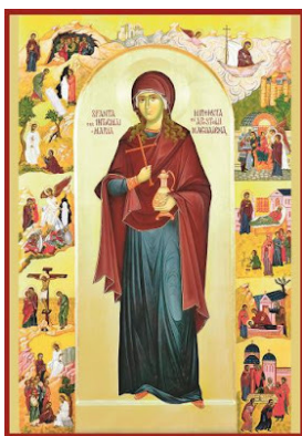
St. Mary Magdalene